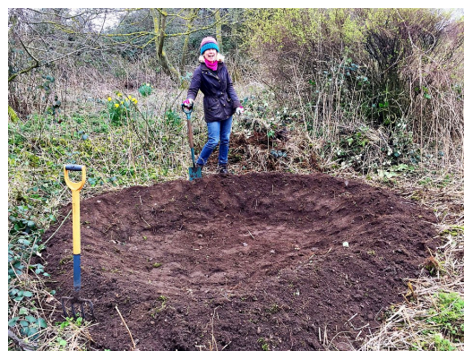
Dew pond under construction - providing a much-needed drinking pool for wildlife

Left National Nest Box week was back in February. The Felbeck Trust volunteers are shown fixing the last bat box at West Beckham Common (Green). It was just one of a variety of open fronted and hole nesting boxes and clusters of bat boxes put up.