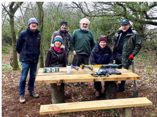
Felbeck Trust volunteers celebrate the completion of a picnic table and benches - EBC

The planned work-party at East Beckham Common went ahead on the 12th March despite the threat of bad weather in the wake of Storm Gareth. The seven hardy volunteers knuckled down to constructing a rustic picnic table & benches and started work on a dew pond at the southern end of the site. Two positive developments for The Common - providing additional facilities for visitors and improved habitat for wildlife - making a contribution towards the stated objectives of Felbeck Trust.