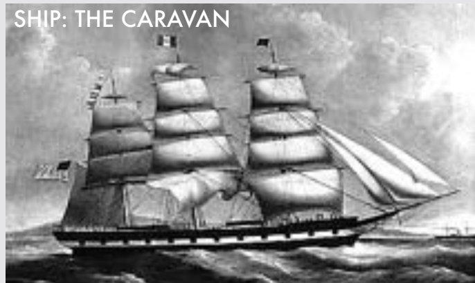
SHIP: THE CARAVAN