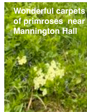
Wonderful carpets of primroses near Mannington Hall