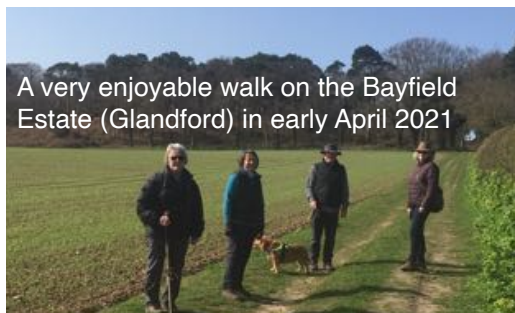
A very enjoyable walk on the Bayfield Estate (Glandford) in early April 2021