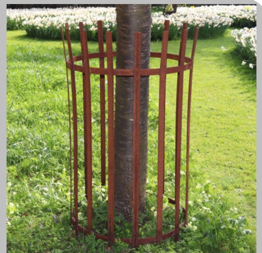
Unpainted/rust finish guards will last a lifetime and look great in a country environment

Designer Metal (Suffolk) Ltd Estate Fencing & Tree Guard Specialists www.designermetal.co.uk info@designermetal.co.uk Tel. 01473 658111